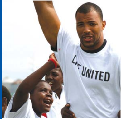
Thursday, June 23 to Friday, July 15, 2011 Next Level Youth Sports Camps Various Locations