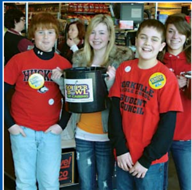
Saturday, February 4, 2012 2012 Souper Bowl of Caring Food Drive Various Locations