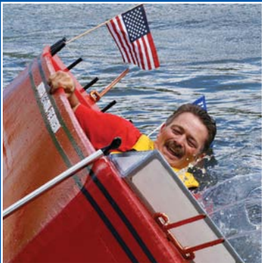
Saturday, August 20, 2011 What Floats Your Boat Cardboard Boat Race Mastodon Lake, Phillips Park, Aurora