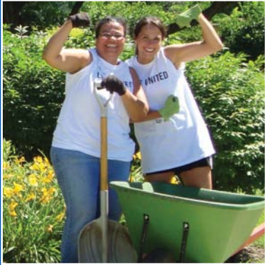
Saturday, June 18, 2011 Day of Caring, Operation Helping Hands